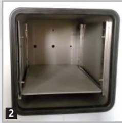
2 Door gasket made of Viton