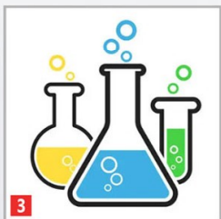
3 Product testing