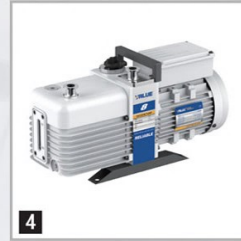
4 Oil vacuum pump