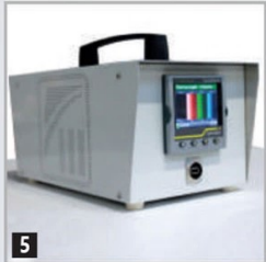
5 Portable paperless recorder with graphical screen