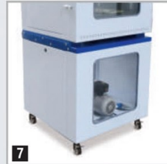
7 Subframe for pump