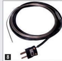
8 Thermocouple J probe