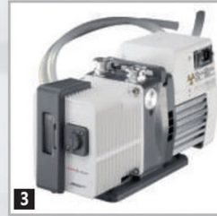
3 Diaphragm pump