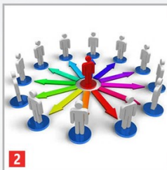
2 Individuation service