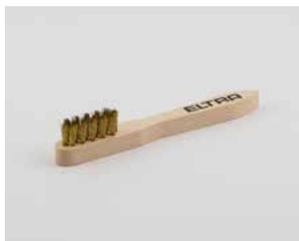
Metal brush (71031)