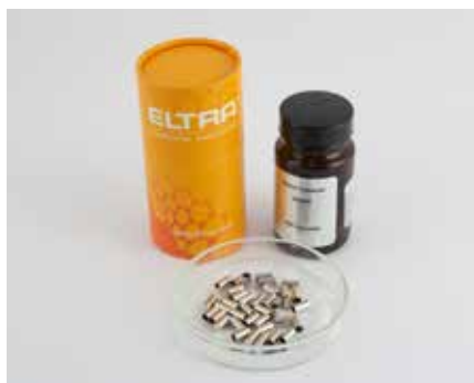
Nickel capsules (90256)