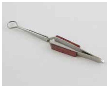
Tongs for crucibles (88400-0213)