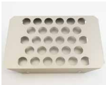
Crucible holder (88600-0015)