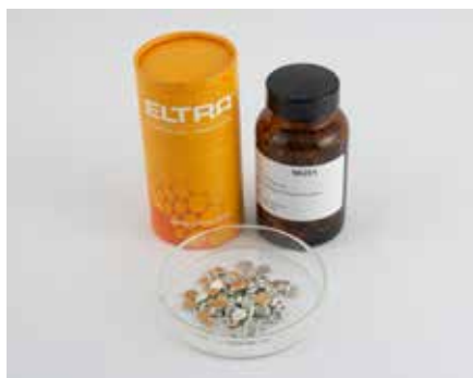
Tin pellets (90251)