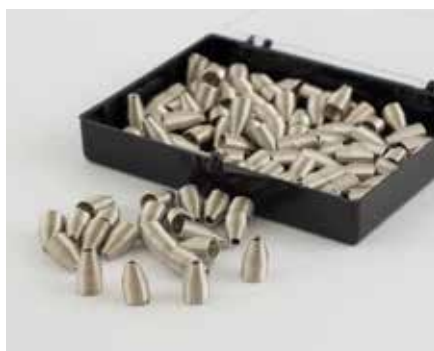
Nickel baskets (90250)