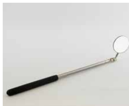
Telescope mirror (88400-0500)