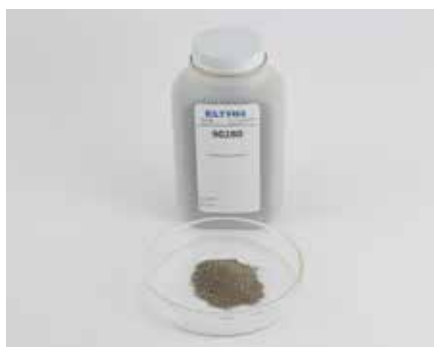
Tin accelerator (90280)