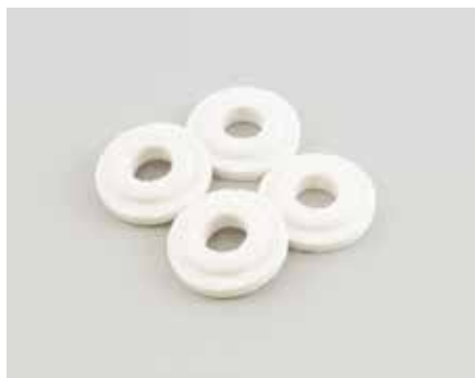
Ceramic lids (88600-0017)