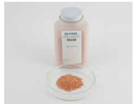
Copper accelerator (90240)