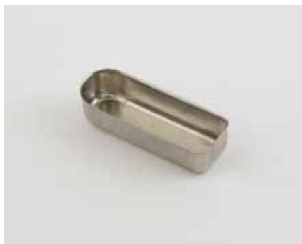
Re-usable inconel boat (88400-0502)