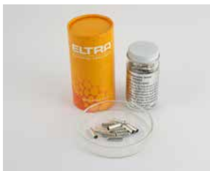
Tin capsules (90252)