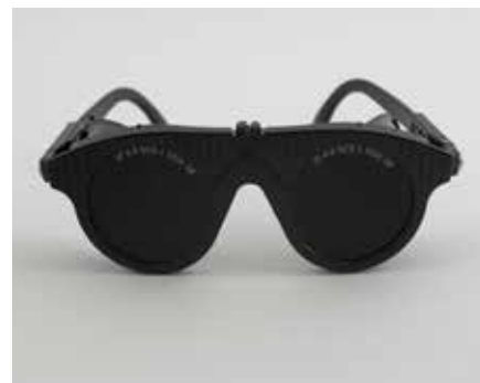
Safety glasses (88400-0499)